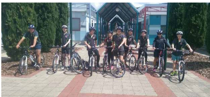
VET Sport and Recreation class before heading off on our bike ride.