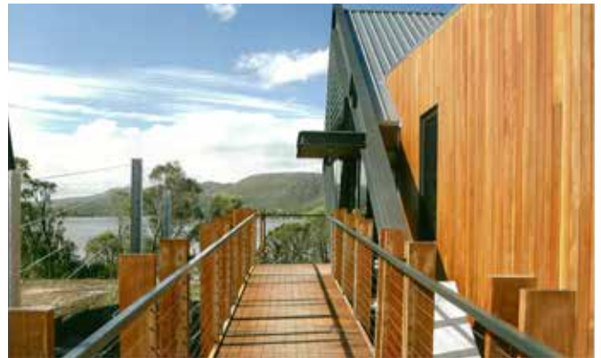
A MONA Pavilion.