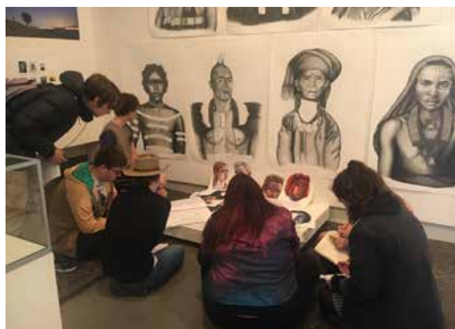
Art Production students discuss an Examiners Choice folio.