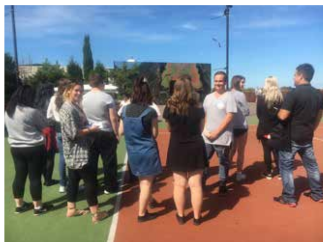
Students reflecting on the exhibition.