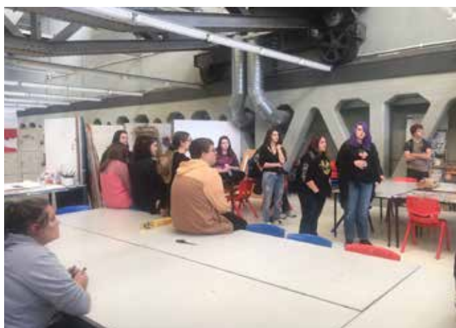
Touring the University of Tasmania Art School at Inveresk.