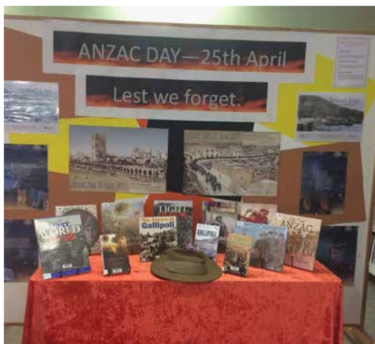
Anzac Day display in the Library.

Of course the main purpose of the library is to provide a great work space for students and the resources they need to help them achieve academically. It is our core business. It is wonderful to see so many using the library regularly, borrowing non-stop and working towards some great results this year.